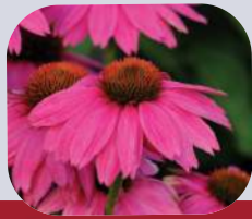
PeaWow Wild Berry