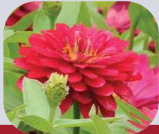
Double Zahara Cherry