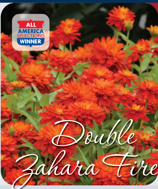
Double Zahara Fire