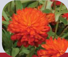
Double Zahara Fire