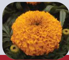
Moonsong Deep Orange